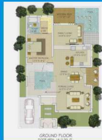
3 Bedrooms Ground + 1st Floor