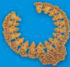
4th SUPER BUMPER DRAW GOLD NECKLACE RS. 2,00,000 WORTH