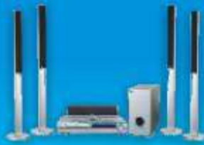
5th SUPER BUMPER DRAW DIGITAL HOME THEATRE SYSTEM RS. 2,00,000 WORTH