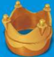
1st SUPER BUMPER DRAW GOLD CROWN (RS. 6 Lacs WORTH)