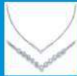
2nd SUPER BUMPER DRAW DIAMOND NECKLACE (Rs. 2,00,000 worth)