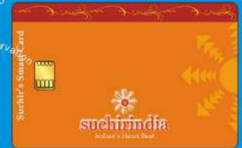
Access to resorts & all company events

On every Rs. 50,000/- investment we receive from the member, his smart card will be credited with 10 miles. The member can redeem the points with exciting gifts/articles. Detailed information brochure will be sent to the individuals.