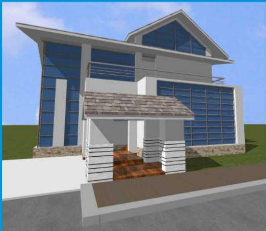
VILLA OPTION FOR THOSE WHO DESIRE WITH ULTRA MODERN FACILITIES